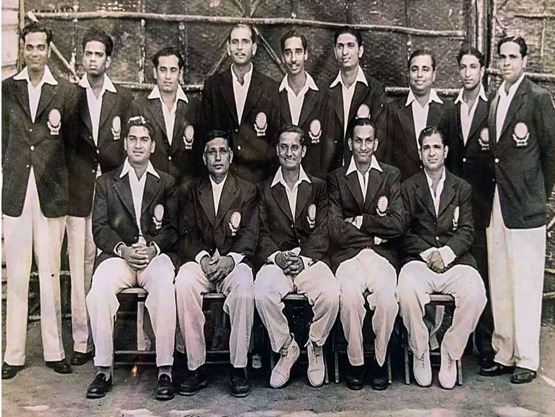
Indian Cricket Team First Test Win 1952

Viswanath made India shine. In 1971, India won West Indies and England and under the Indian Captain Ajit Wadekar. Gavaskar scored 774 runs in the West Indian series while Dilip Sardesai's 112 played a big part in their one Test win. In 1970s, India continued to grow in Cricket and gaining strength in batting and spin bowling.