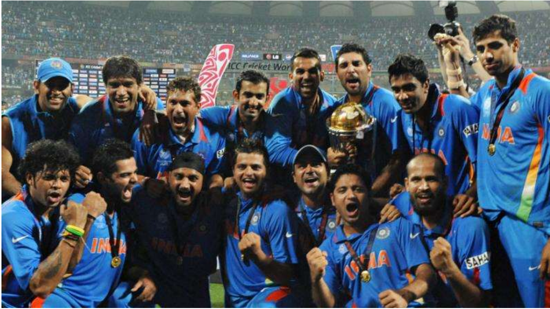
Indian Cricket Team 2011