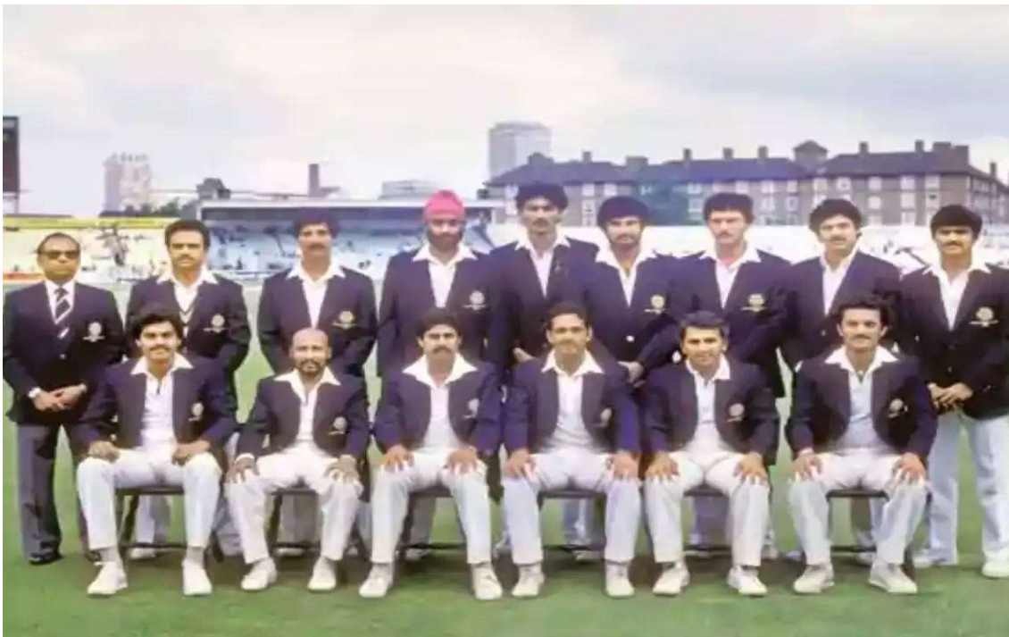
Indian Cricket Team 1983