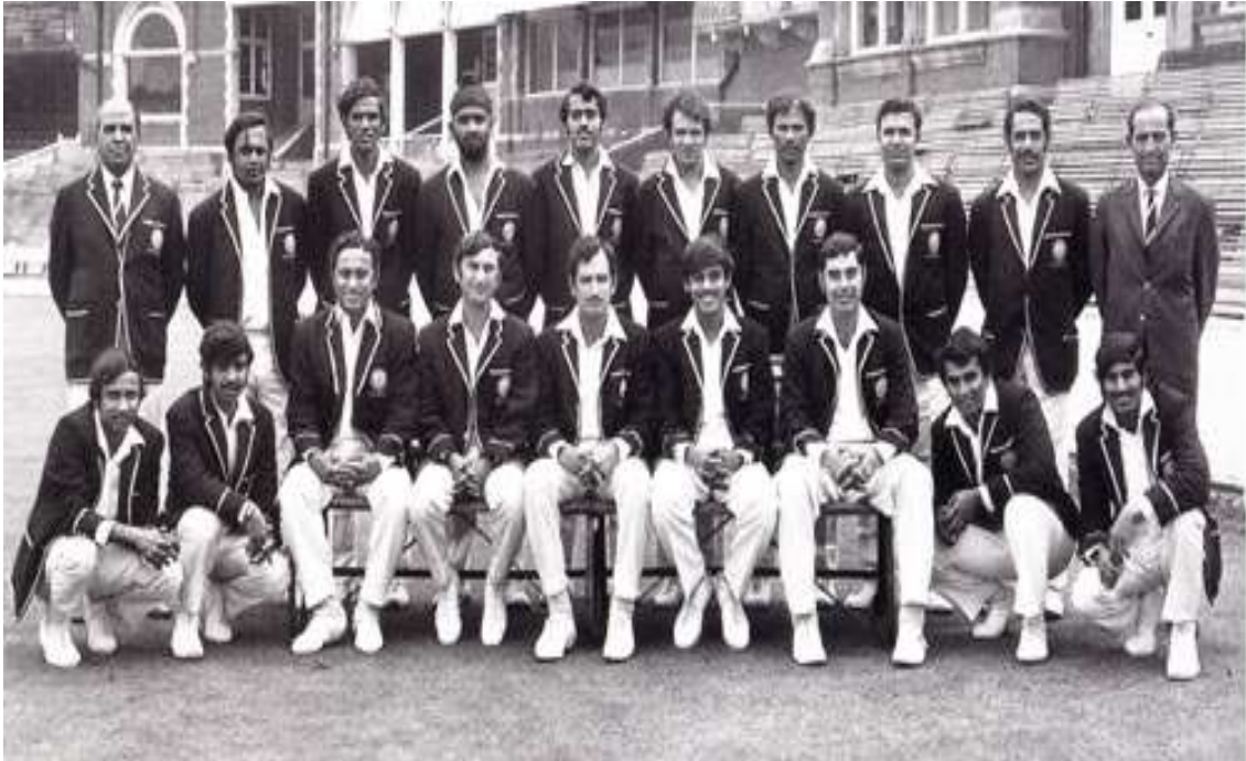
Indian Cricket Team 1971

Cup and in 1985, won the World Championship of Cricket in Australia. In 1986, India won the Test series victory against England. Sunil Gavaskar made a record of 34 centuries in Test matches and became the first batsman to score 10,000 runs. Kapil Dev became the highest wicket taker in Test cricket with 434 wickets.