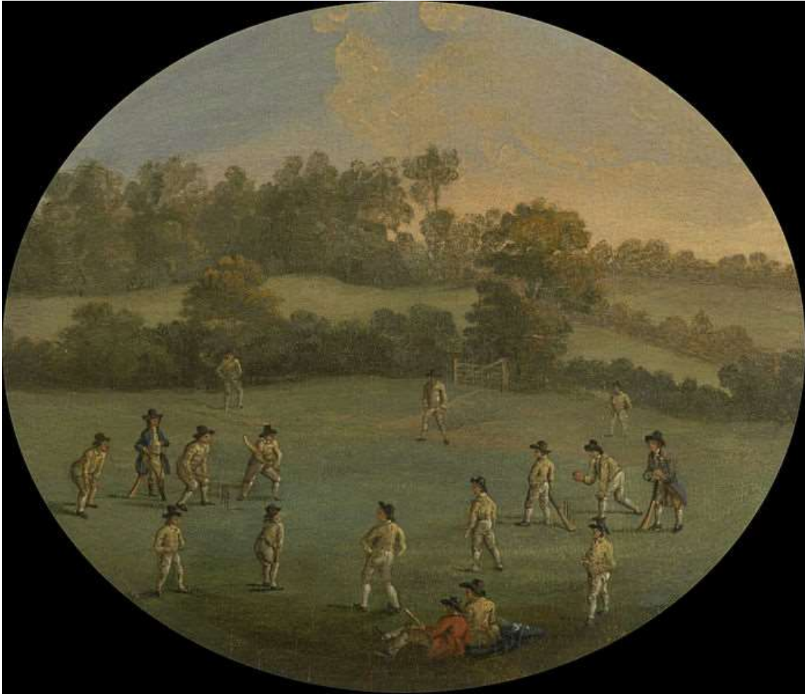
The Royal Academy Club in Marylebone Fields

Cricket is a sport with a history which started in late 16th century. It started in England and has evolved and established as a sport in 19th and 20th centuries globally. International matches have been played since the 19th century and Test cricket matches are played from 1877. Laws Committee of the Marylebone Cricket Club (MCC) in London owns and maintains the Laws of Cricket, with consultation with ICC.