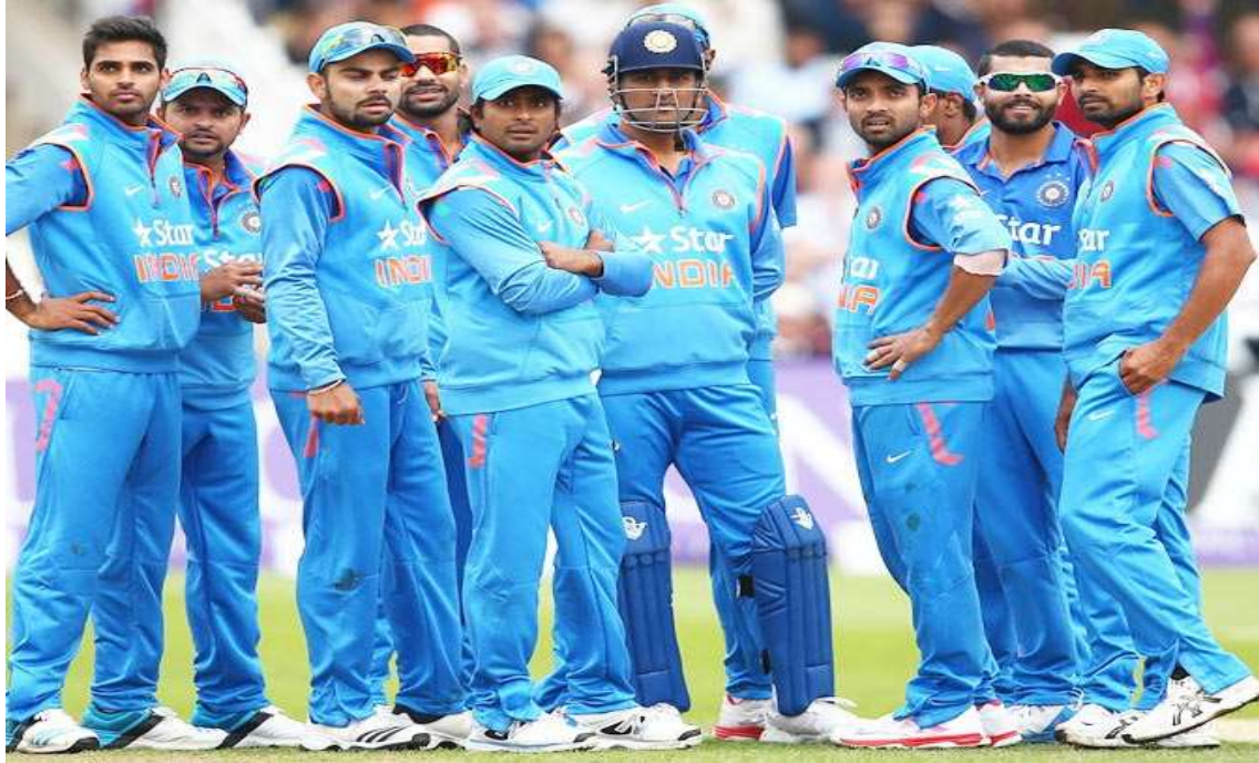
Indian Cricket Team 2015

only we won the Test series, India also qualified for the 2021 ICC World Test Championship Final. India also played the T20I series which India won 3–2 and the ODI series which they won 2–1. Then, India played the 2021 ICC World Test Championship Final against New Zealand in Southampton in which India lost by 8 wickets. India went on to play an away series against England for five tests. In that, India lead the series 2-1 since the fifth test was cancelled due to the COVID-19 pandemic.