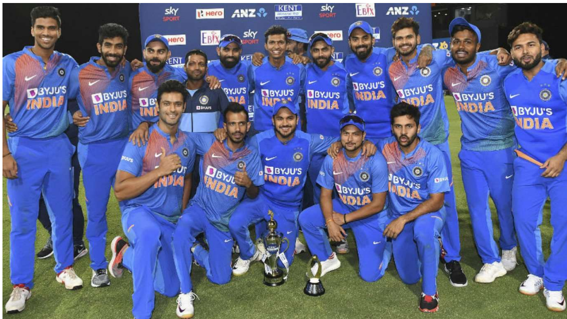
Indian Cricket Team 2021