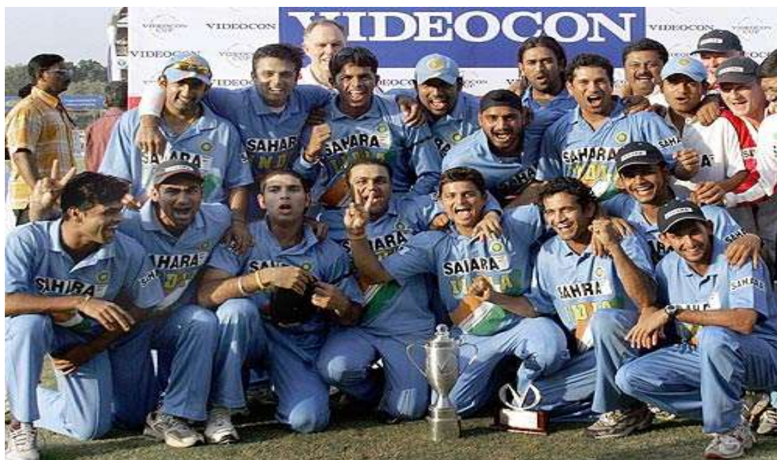
Indian Cricket Team 2005